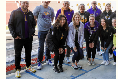
Los Angeles Lakers Team with L.A. Works at the Annual MLK Day of Service